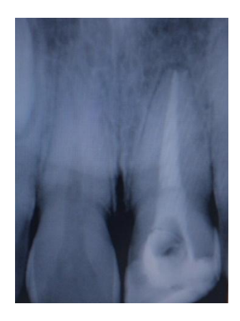
Fig. 2. Radiological examination