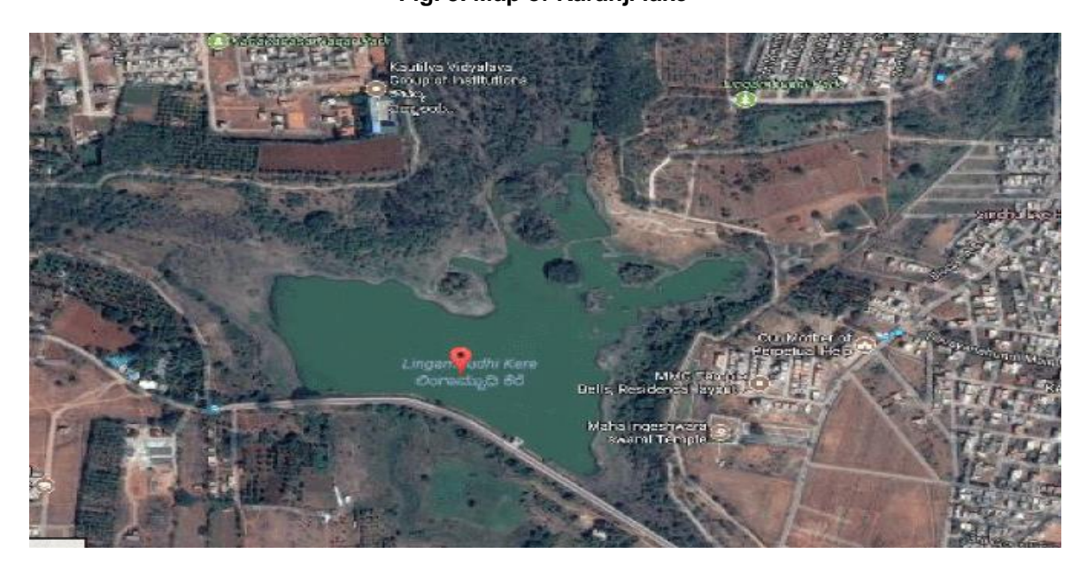
Fig. 4. Map of Lingambudhi lake

(lingambudhi lake) at mysore. Lake 2010 [8], Wetlands Biodiversity and Climate Change, studied the Canadian Council of Ministers of the Environment (CCME) Water Quality Index (WQI) rates the lake water of Lingambudhi as poor and the water quality is always threatened which deviates considerably from normal. Storm water harvesting and removal of limiting nitrates and phosphates from urban water runoff and as well, limiting the anthropogenic activities around the lake are among the promising solutions in regulating the entry of nutrients in to the lake. The Canadian Council of Ministers of the Environment (CCME) Water Quality Index (WQI)