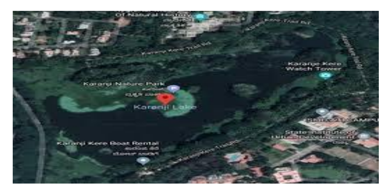
Fig. 3. Map of Karanji lake