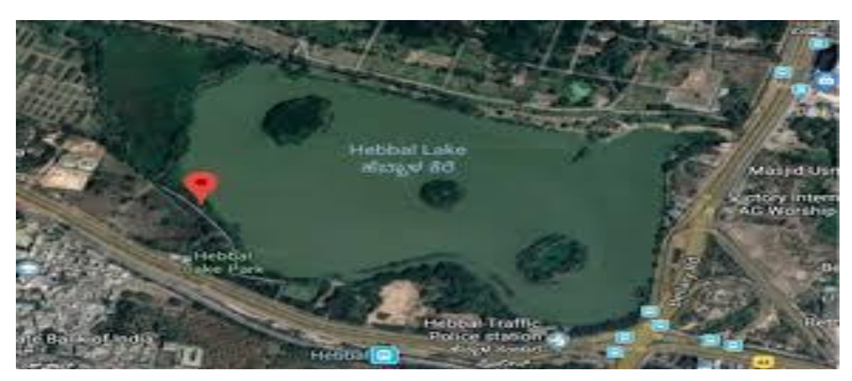
Fig. 5. Map of Hebbal lake

"Dalvoy lake is one of the main waterbodies located in southern Mysore adjacent to nanjungud road. It was constructed during period of maharaja in 19<sup>th</sup>centuary for irrigation, drinking and for other related purpose. The catchment area of dalvoy lake is 2615 acres covering shettykere, dalvoyserie, Gudumadanahally pickup and marshy pickup. Mahesh and A.Balasubramanian Analysis of Water Quality