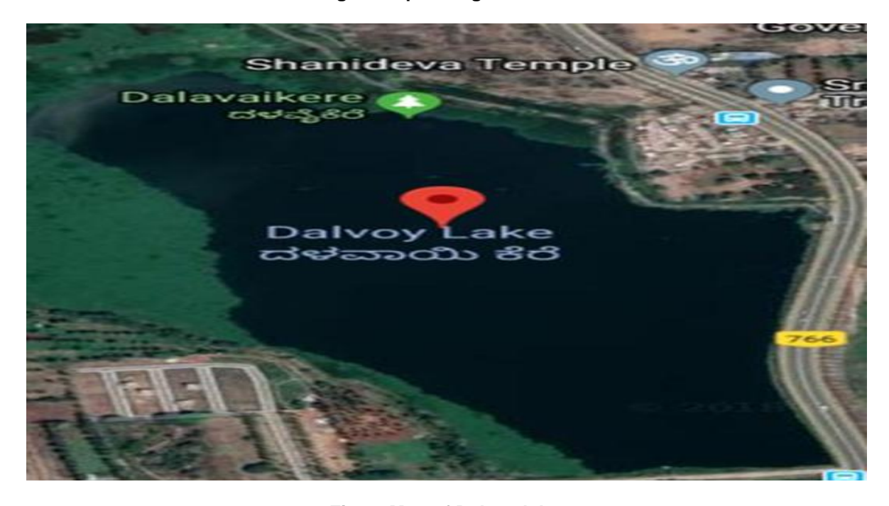
Fig. 7. Map of Dalvoy lake

Index (WQI) in Dalvoy lake, Mysore city, India, Nature Environment and Pollution Technology, An International Quaterly ScientificJournal 2010 Vol 9, PP 663-673" [11]. The water quality indicators were determined for all locations and grouped according to season. The WQI of Dalvoy Lake was found to be poor, with the main reason of deterioration being a lack of sufficient sanitation, untreated inflow water with municipal sewage, and uncontrolled anthropogenic activity.