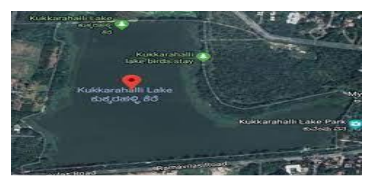
Fig. 2. Map of Kukkarahalli lake