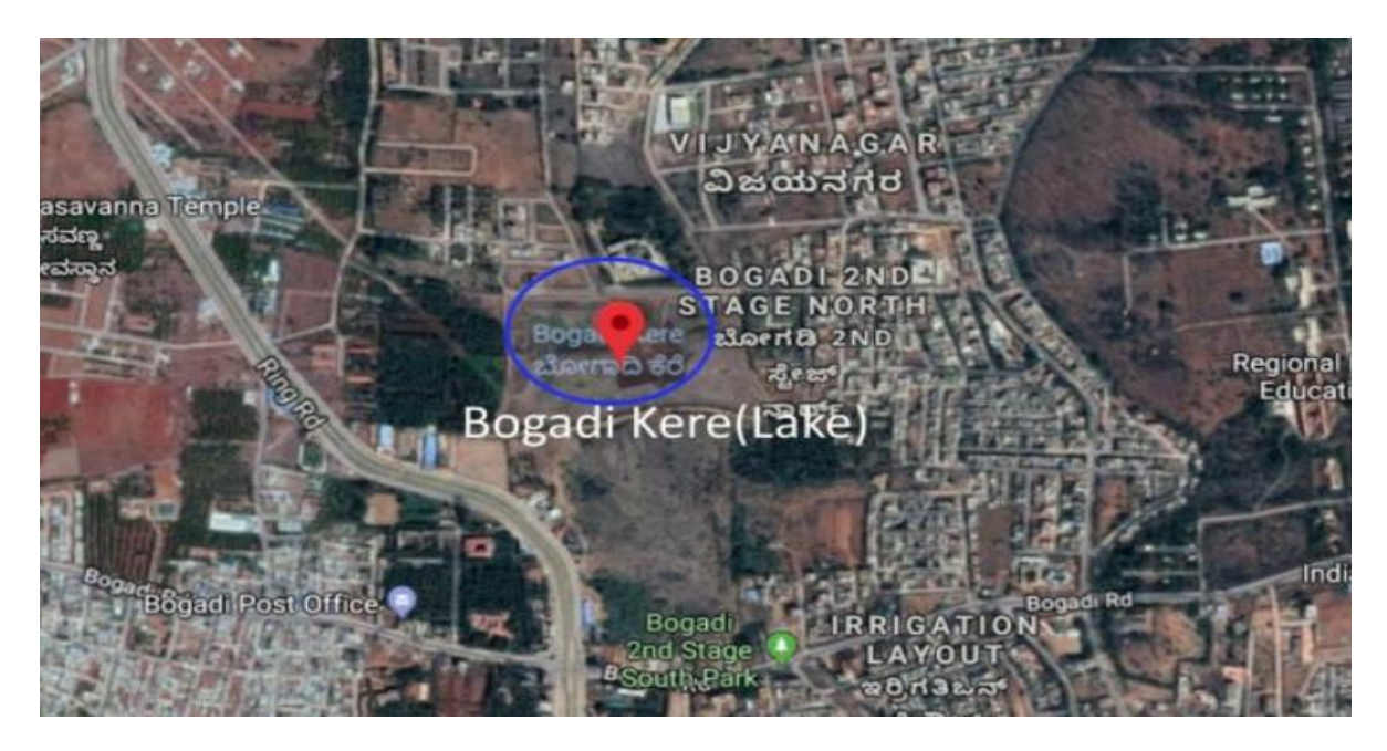
Fig. 6. Map of Bogadhi Lake