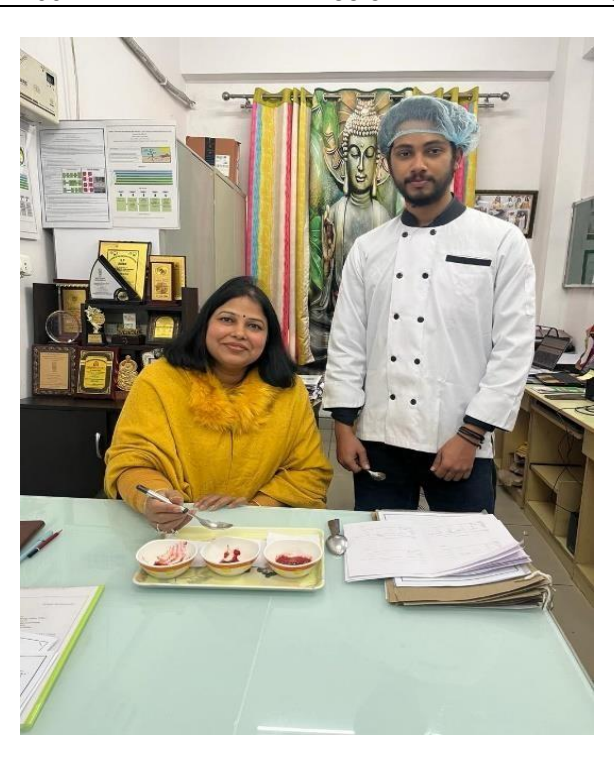
Fig. 3. Sensory evaluation