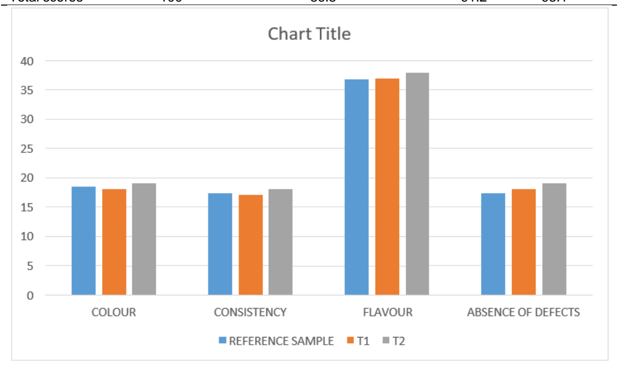
Fig. 4. Graphical representation of sensory evaluation