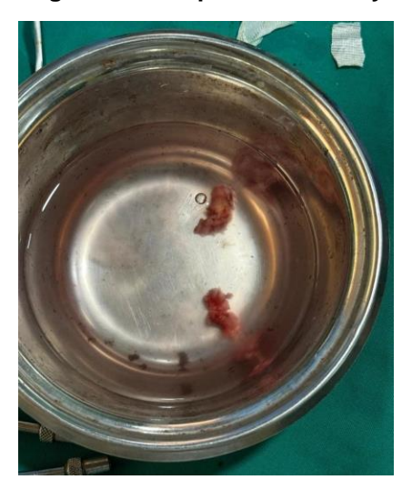
Fig. 4. Encapsulated lesion