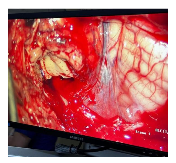
Fig. 3. Suboccipital craniotomy

excised, measuring approximately the same as described on CEMRI (Figs. 3, 4). Primary dural closure was done, bone flap replaced and the patient was extubated. Post operative recovery was unremarkable. Due to high clinical suspicion of tuberculoma, anti tubercular drugs (ATT) viz. Ethambutol-15mg/kg, Rifampicin-10 mg/kg, Pyrazinamide-25 mg/kg, Isoniazid-5mg/kg and intravenous dexamethasone were started for this Histopathological analysis specimen revealed caseating granulomatous inflammation and presence of acid fast bacilli in Ziehl-Neelsen stain.On postoperative day 2, the left ocular gaze restriction had disappeared and the patient no longer complained of diplopia or headache. She was discharged on post operative day 10 after removal of the skin sutures with the instructions to continue ATT and to continue nutritional rehabilitation.