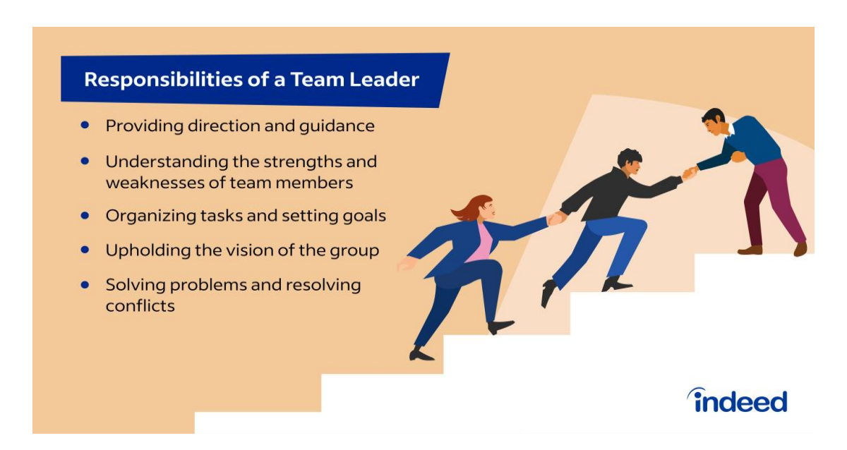
Fig. 1. Responsibilities of a team Leader