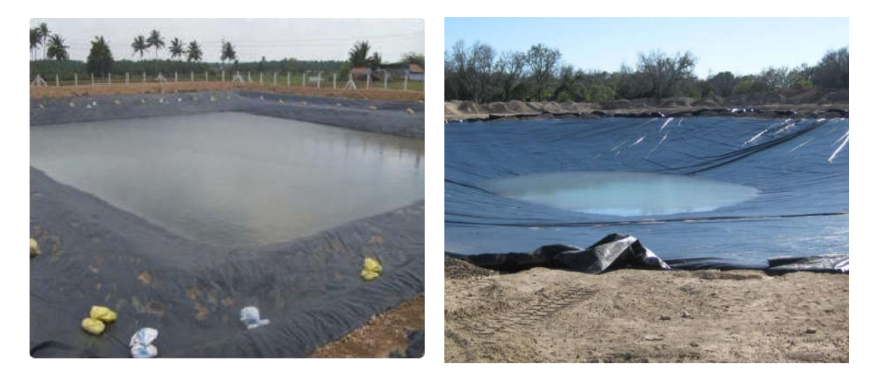
Fig. 16. Lining of farm pond with plastic film

marigold and maize were demonstrated under open field condition. Effect of mulching on tomato & capsicum were demonstrated under polyhouse and shadenets during the year 2017-18. The growth and yield parameters were recorded and compared with no mulch crops under respective climatic condition. The results showed that crops under mulch were recorded highest yield (10-60%) compare to no mulch. Similarly results depicted that there is no effect of mulching technology under polyhouse and shad net on yield parameters.