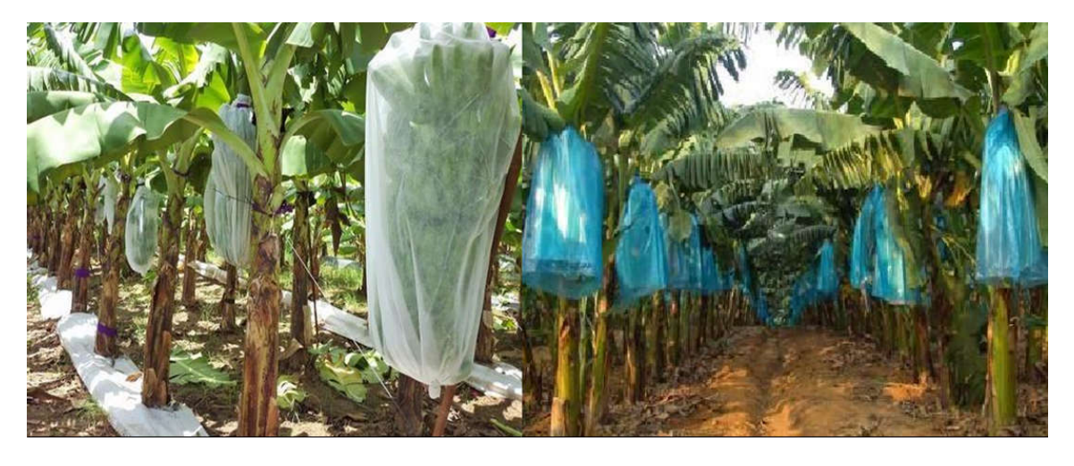
Fig. 15. Banana bunch covering with plastic

and marketing of agricultural produce. Traditional packaging techniques such as wooden crates and jute bags have many disadvantages like untreated wood can easily become contaminated