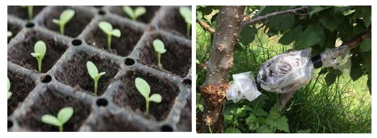
Fig. 11. Plug trays