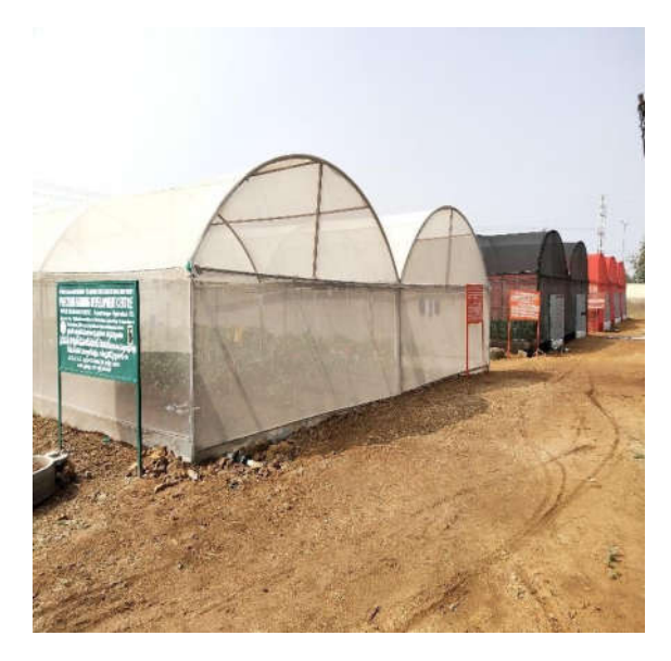
Fig. 4. Different colored shadenets, college farm, PFDC, PJTSAU, Hyderabad

transparent to light, anti-fogging and anti- algae. Polyhouse cultivation is very important because it can moderates temperature and humidity, increases yield, quality and reduces crop duration, conserve moisture thus needs less irrigation, cultivation of off-season crops possible, helps to grow crops in different climatic conditions as it provide favourable condition to plant and to grow high value crops for export market. Moreover, it helps in raising early nurseries for different crops and also helps in hardening of tissue cultured plants and grafts. Shed net are used in rising of nursery structure which is made up of polythene threads. To reduce light intensity different shed net are