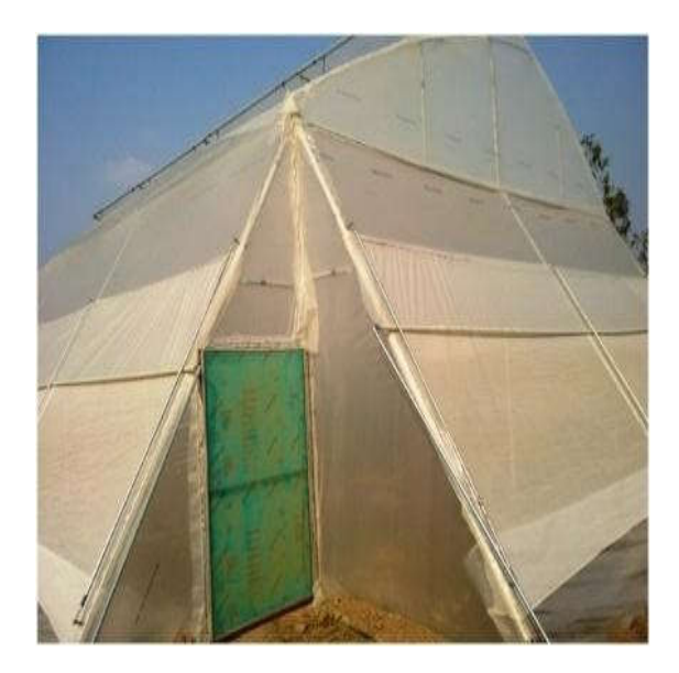
Fig. 3. Polyhouse cultivation, Horticulture Garden, PFDC, PJTSAU, Hyderabad

transparent to light, anti-fogging and anti- algae. Polyhouse cultivation is very important because it can moderates temperature and humidity, increases yield, quality and reduces crop duration, conserve moisture thus needs less irrigation, cultivation of off-season crops possible, helps to grow crops in different climatic conditions as it provide favourable condition to plant and to grow high value crops for export market. Moreover, it helps in raising early nurseries for different crops and also helps in hardening of tissue cultured plants and grafts. Shed net are used in rising of nursery structure which is made up of polythene threads. To reduce light intensity different shed net are