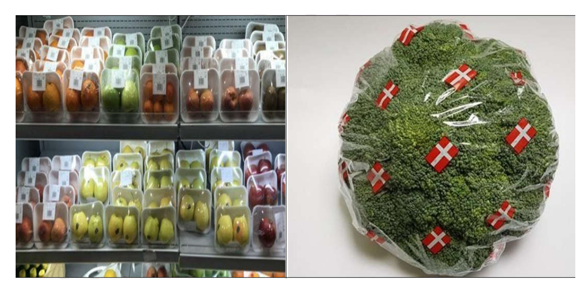
Fig. 14. Fruits and Vegetables packaging using plastic sheets