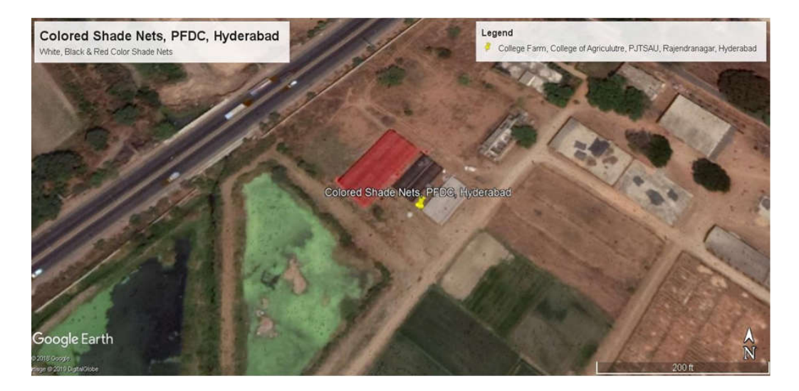
Fig. 2. Research trial under different colored shadenets at college farm, CoA, PJTSAU, Rajendranagar, Hyderabad