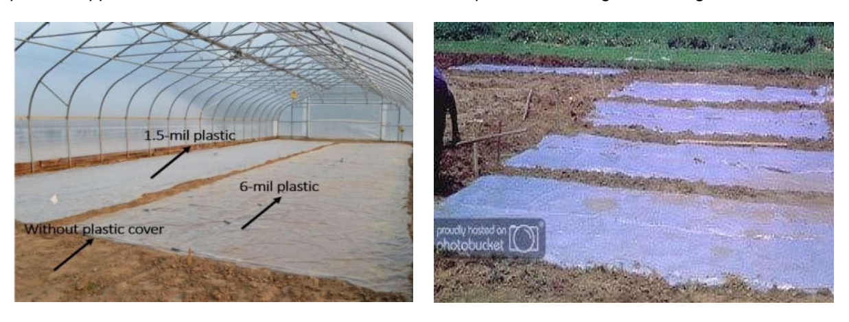
Fig. 9. Soil solarisation under polyhouse and open field

Packaging is one of the most critical areas in the distribution and marketing of agricultural produce. More than 30% of agricultural produce is lost between the chain of farm and consumer. The packaging must stand up to long distance transportation, climate, storage condition, multiple handling during distribution