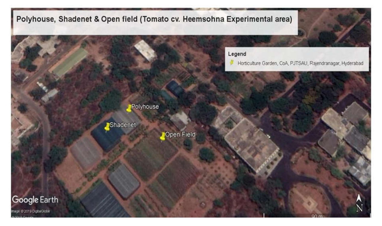
Fig. 1. Research trial under polyhouse, shade net and open field condition at horticulture garden, CoA, PJTSAU, Rajendranagar, Hyderabad

Polyhouse is a framed structure covered with plastics film (transparent and translucent) in which plants are grown under the partially or fully controlled environment. The polyhouse technology has been considerable importance in better space utilization, growing crops in extreme climatic conditions. The plastics film used in polyhouse act as selective radiation filters. The properties of cladding material are UV stabilized,