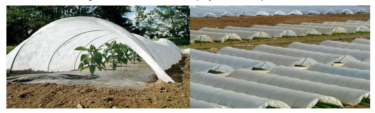
Fig. 10. Low tunnels