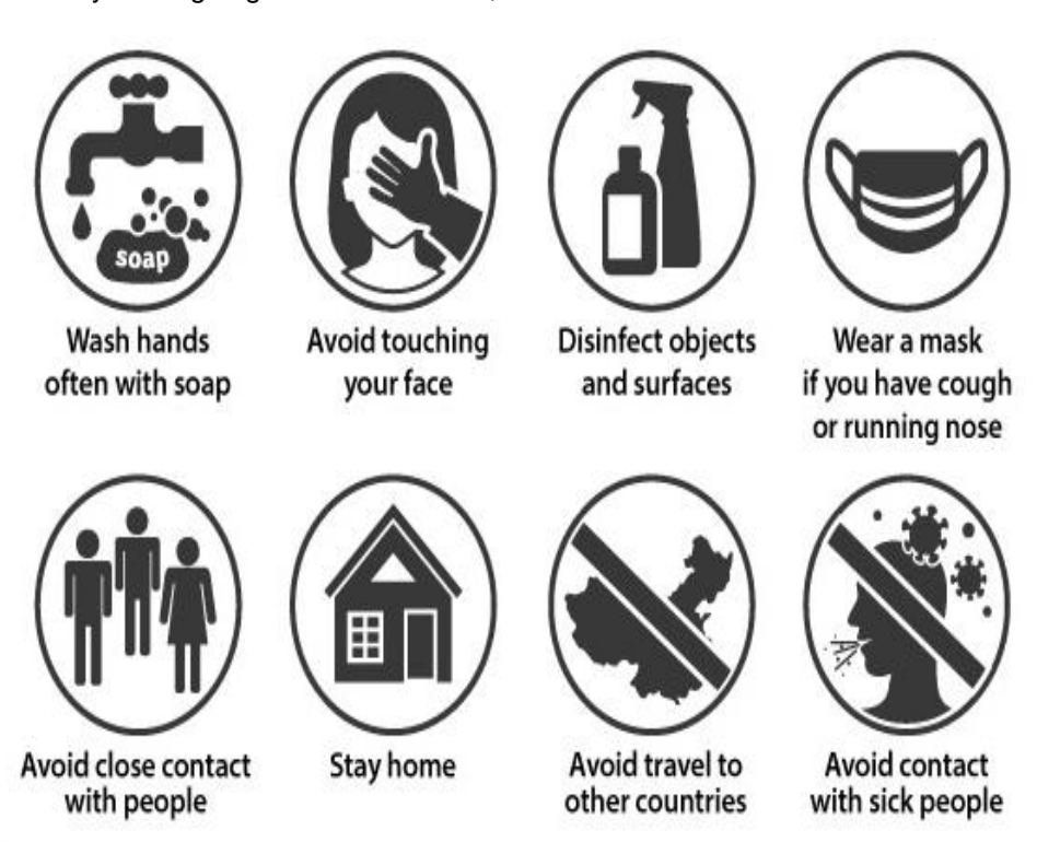
Fig. 2. Ways of prevention from COVID-19(Coronavirus)

Everyone needs good nutrition and hydration and the two are vital. Those who eat a well-balanced diet tend to be safer with better immune systems and less chance of developing chronic diseases and infectious diseases. Start eating unprocessed and nutritious food every day [15,16].