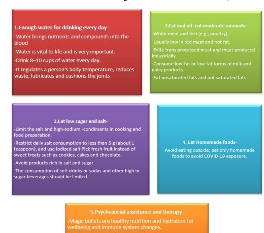
Fig. 3. Adult diet guidance during covid -19 pandemic

Note: Don't overcook fruits and vegetables because of the loss of important vitamins