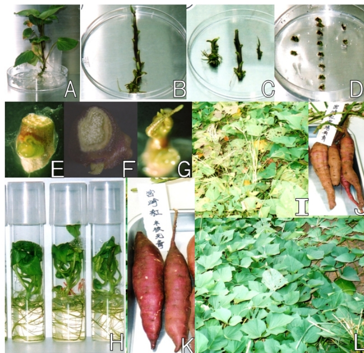
Fig. 4. Clonal propagation in large quantity using sucker culture from stems of detected virus-free plants. A) The recovery plant used as material for shoot apex culture; B) Stem from A); C) Stem cut into upper, middle and lower parts; D) Suckers cut from the upper (right), middle (center) and lower (left) parts; E-G) For easy visualization, the suckers from lower, middle and upper, were expanded in size, respectively; H) The complete plants grown from the suckers of E-G, respectively, after 6 weeks of culture; I-J) The growing plants of SPFMV- sufferer in the field, and its tubers; K-L) Tubers obtained from the recovered SPFMV-free plants after cultivation of two seasons, and the recovery plants growing in the field.

for alcohol production, reservation of genetic characteristics for molecular breeding, and so on. Using the rapidly and precisely clonal propagation system of virus-free recovery plants established in this study, the production of high quality and high commercial value of sweet potato will be more possible not only in southern Japan but also in Eastern Asia, Africa and moreover in the world.