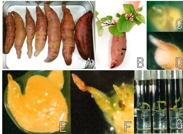
Fig. 2. Recovery of sweet potato feathery mottle virus (SPFMV)-free sweet potato using cultures of shoot apex. A) Sweet potato with russet crack-like symptom (RC-LS) (left six tubers) and healthy one (right one tuber) used in this study; B) New plants growing from RC-LS-infected tuber; C) Shoot apex 0.1-0.3 mm in size token from RC-LS plant and cultured on Komamine& Nomura (1998) medium supplemented with 0.05 \mu\text{M} NAA and 4.44 \mu\text{M} BAP; D) Elongated initial leaf after 3 weeks of culture; E) Meristem and growing of two initial leaves after 6weeks of culture; F) One big leaf and two initial leaves after 9weeks of culture; and G) The complete plants after12 weeks of culture on phytohormone-free MS medium