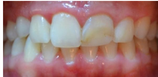
Fig. 1. Retracted preoperative full-mouth view showing discolored margins of resin

objective evaluation of single tooth crown has been confirmed by recent studies [11].