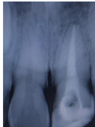
Fig. 2. Radiological examination