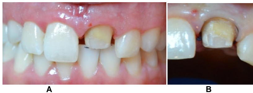
Fig. 3. Abutment tooth after healing period: Tooth preparation