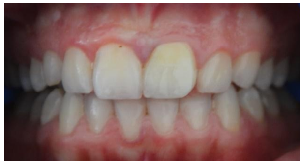
Fig. 4. Retracted close-up postoperative view of the maxillary anterior restoration