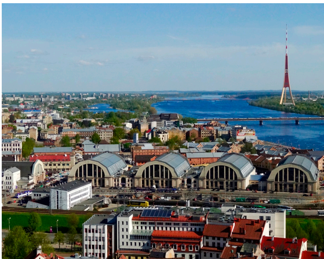
Figure 3. “Riga Central Market is one of the city’s most recognizable structures” (Jay Way Travel 2016, p. 1).

Meanwhile, it appears that the majority of interviewees believe that to make RCM more attractive to tourists it would be crucial to create an iconic image for the market. This would mean a picture or illustration that would represent RCM in the midst of Riga as shown in Figure 3.