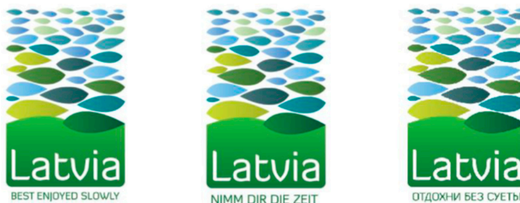
Figure 2. “Latvian tourist brand and slogan in English, German, and Russian” (Serdane 2017, p. 7).

While the literature on slow tourism is still evolving, Latvia with its present tourism marketing brand “Latvia: Best enjoyed slowly” (see Figure 2) is officially promoted as an appropriate destination for slow tourism and is currently the only destination that has applied the slow philosophy in destination marketing at a national level, making the setting of the research unique (Serdane 2017). The new tourism brand claims to follow these principles since the “basic values of the Latvia tourism brand are characterized by truthfulness, profoundness, easiness and confidence grounded in the Latvian environment, culture and people” (Serdane 2017; Latvian Tourism Development Agency 2010, p. 15).