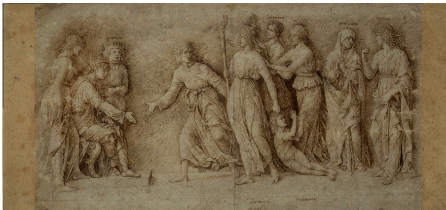
Figure 1 The Calumny of Apelles, drawing by Andrea Mantegna (≈1504–6). Available online at: http://www.britishmuseum.org/explore/highlights/highlight_objects/pd/a/mantegna_calumny_of_apelles.aspx . The picture is explicitly explained on the British Museum Website as follows: ‘Each of the figures is identified in Mantegna’s handwriting. Sitting on a throne is the judge with large, ass’s ears, extending his hand to Calumny (Slander). Behind him stand Suspicion on the left and Ignorance on the right, who maliciously advise him. Calumny holds a torch in one hand to suggest her blazing fury, and with the other hand drags a young man by the hair. He stretches out his hands to heaven and asks the gods to witness his innocence. Envy, a thin pale man, leads Calumny, while two servants, Treachery and Deceit, adjust her hair and dress. The last two figures in the procession are Repentance, a mourning woman who wrings her hands, and finally Truth, pointing to heaven and with tears in her eyes.’ Reproduced with permission from the British Museum Website. Lessons for urologists: The deceitful nature of society has not changed from Greek times – the many drawings and paintings depicting the Calumny of Apelles all use a Greek description (and the artists imagination/biographicisation) to reconstruct the scene. Perhaps the problem is that this topic (discussed in liberal arts programmes) loses its impact as it is not brought to the attention of urology residents and young faculty. The persistence of corrupted society would be a very useful topic for physicians to attack (as it is the basis of many diseases). However, it will take the lifespan of a host of courageous individuals to develop pragmatic solutions!

The most useful LL for the physician, would be continuous, have no endpoint, no pre-formed curriculum, and no assessment other than as a special auto-generated, reflective, ‘meta-cognitive’ activity. However, it would have a well defined source for learning (society) and well defined direction (benefit to society). Whilst learning from society and building relational networks, it must proffer services valued by society. It is internally driven, in contrast to the externally motivated learning that we undertake because of specific vocational/professional needs such as re-certification and job transitions.