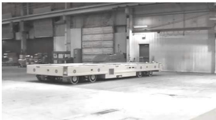
Fig. 1. Agvs for early factory applications