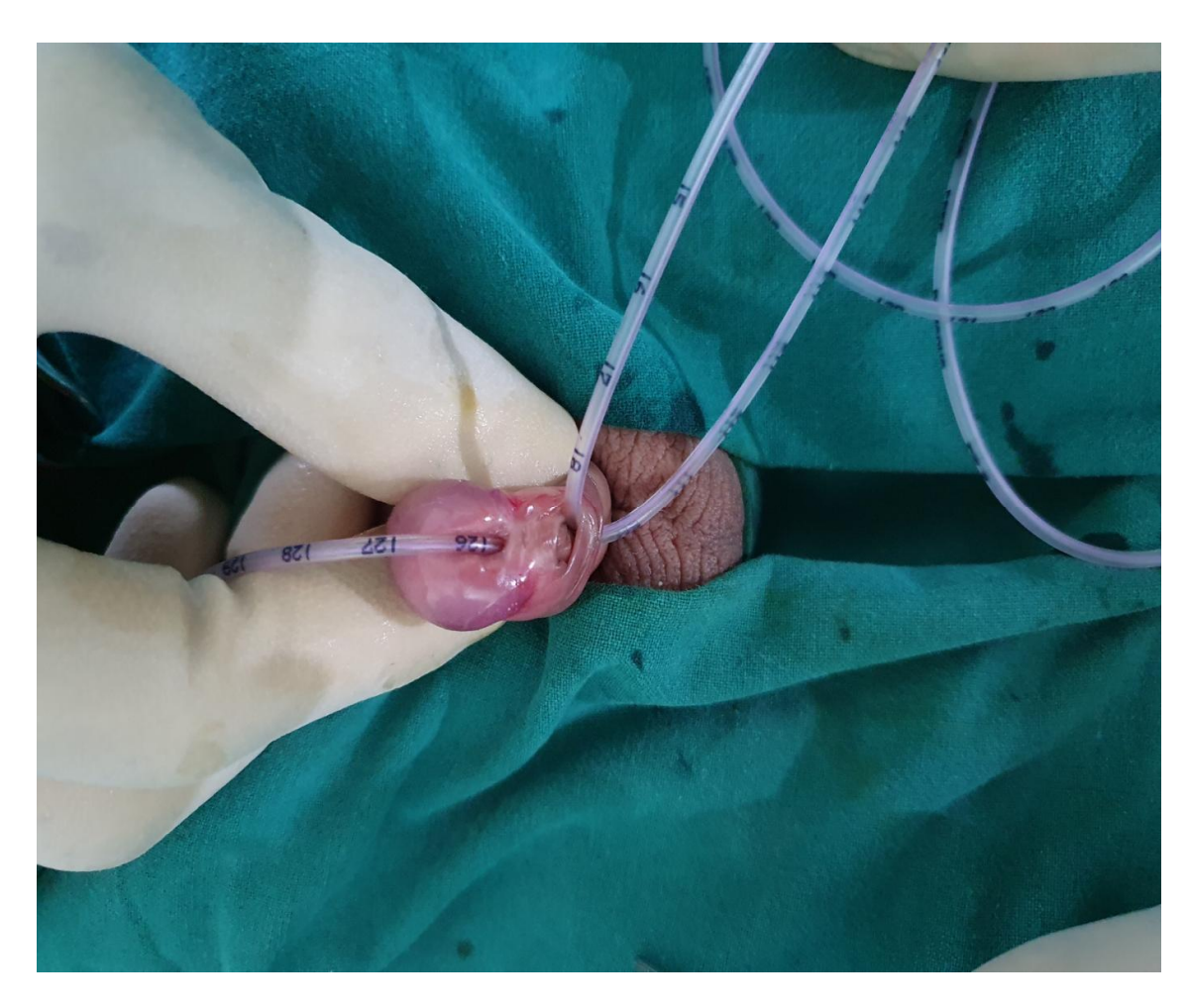
Fig.1. Appearance after retracting the prepuce. Normal meatus and neourethra