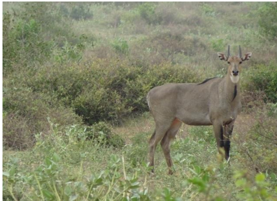
a. Male Nilgai in HCBF, Dumraon

undulating hills, in thin bush with scattered trees to cultivated plains, but not in dense forest and steep hills [6,20,21]. The present study is in correlated with some earlier studied on wild mammals reported from differe [3,7,8,11,13]. They reported regarding ecology and status of wild animals Macaca mulatta , Presbytis entellus , antelopes etc. They were also documented many plants like Prosopis juliflora , Acacia catechu , Prosopis. Cineraria , Prosopis. Spicigera , Meliaazedarach , Azadirachta indica . [10]. Documented the diversity abundance and composition of non human primate's P. entellus and M. mulatta . [6] Reported mammalian diversity like deer (Black bucks, barasingha), Nilgai (blue bull), wild boar, Indian porcupine and chiropteran (flaying fox) etc in Dumraon. They also documented many plants and vegetation are covering is in small patches consist mainly Ziziphus , Acacia , Madhuca , Syzygium , Ficus , Mangifera , Boassum , Bambusa , Azadirachta , Adina , Albizia , Dalbergia etc. in HCBF [19].