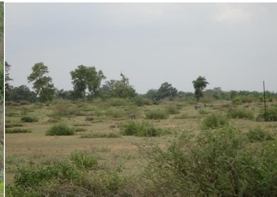
b. Male scattered in HCBF, Dumraon