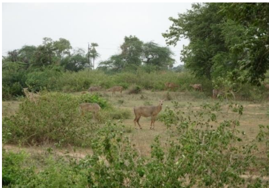
c. Female in group with juveniles