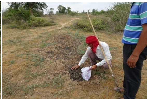
d. Nilgai piles (lavatory)