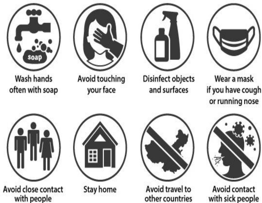
Fig. 2. Ways of prevention from COVID-19(Coronavirus)

Everyone needs good nutrition and hydration and the two are vital. Those who eat a well-balanced diet tend to be safer with better immune systems and less chance of developing chronic diseases and infectious diseases. Start eating unprocessed and nutritious food every day [15,16].