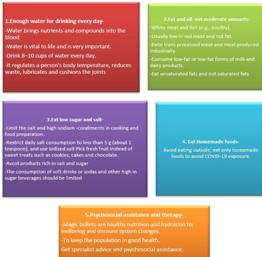
Fig. 3. Adult diet guidance during covid -19 pandemic

Note: Don't overcook fruits and vegetables because of the loss of important vitamins