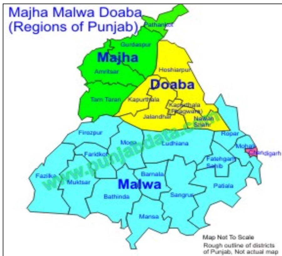
Fig. 1. Map of study area

Exploratory in nature, the present study was based on primary data collected from farmers of Punjab by using multiple stage random sampling. At Level I, four districts were randomly selected from three cultural regions of Punjab i.e. Jalandhar from Doaba, Amritsar from Majha and Sangrur and Moga from Malwa region. (Two districts were chosen from Malwa region for it being the largest of the three regions). A map of study area is given below.